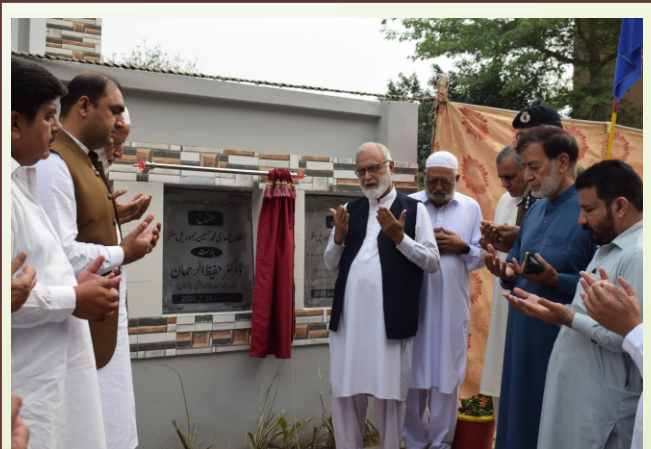
Inauguration AFSS Newly Constructed Building