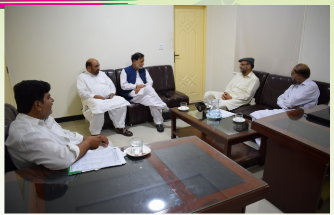
Meetings b/w AFSS Pak & AFSS Norway Managements